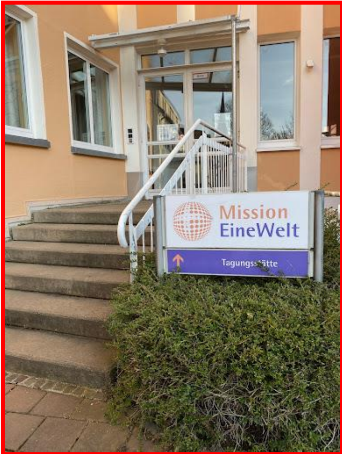
ELCB Mission OneWorld Office