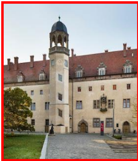
Luther's House in Wittenberg