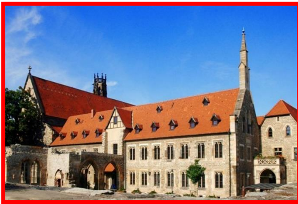
St Augustine's monastery – Erfurt