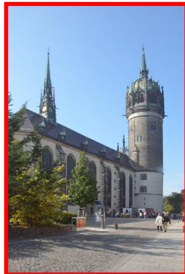
Castle Church – Wittenberg