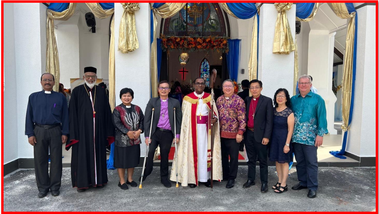
Anniversary of the Zion (ELCM) Congregation (30 th November 2024)