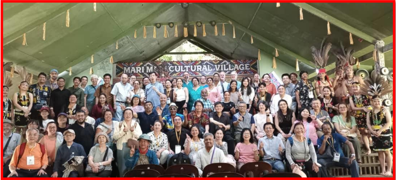
The ALIC Conference Delegates visiting MARI-MARI Village for cultural exposure