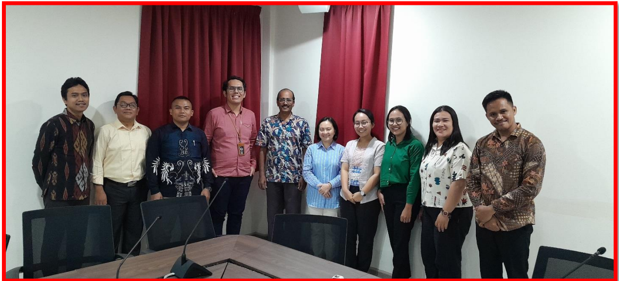
Leaders of Batak Lutheran Churches in Indonesia attending a Lutheran Identity program conducted by Lutheran Study Centre at Seminari Theoloji Malaysia (23 -24 January 2025)