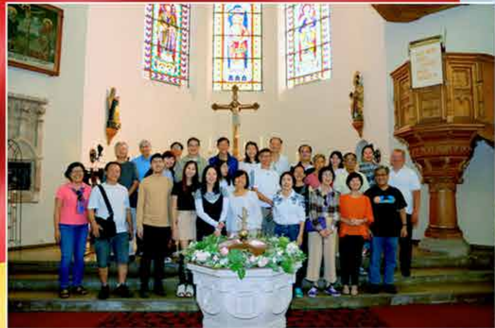
St. Nikolai Kirche, Neuendettelsau, Germany. 圣尼可拉教堂, 纽恩德特绍, 德国